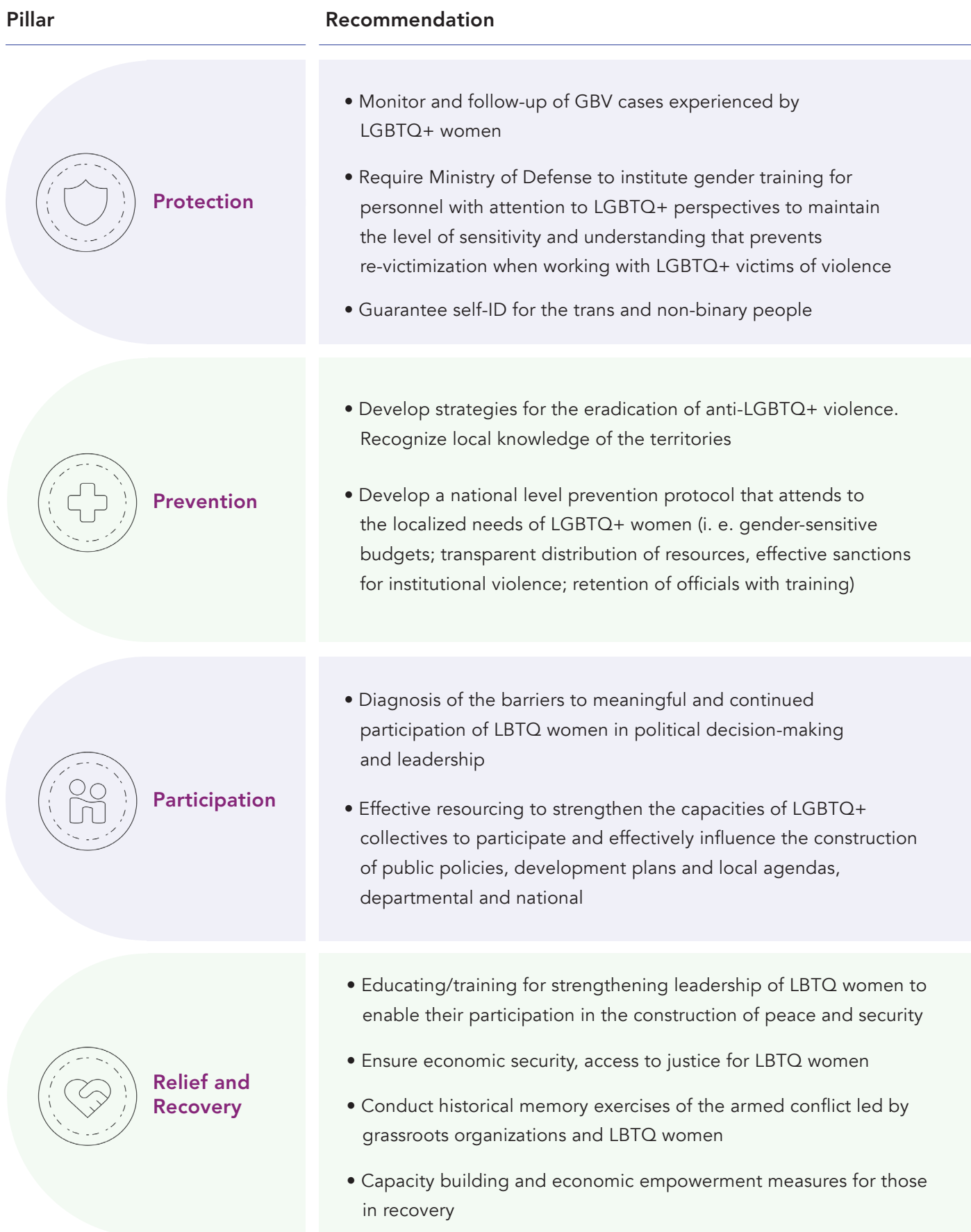
Table 4: Recommendations for addressing needs of LBT women in Colombian NAP